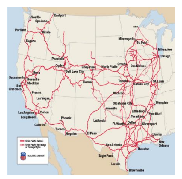
Figure 1: UP Rail Map

Not sure what line is in your area? Consult the maps below (links provided in figure title).